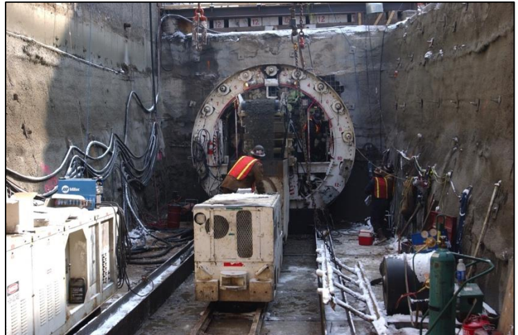
Drainage pipes on south I-25. The Central 70 system is being built to handle a 100-year storm event; similar to I-25.

Yes. The T-REX Project on south I-25 included a comparable lowered section of the interstate between Broadway and University Street between two Denver neighborhoods, Washington Park and Platt Park. Prior to T-REX, this area had significant historical flooding issues. The T-REX Project drainage system was comprised of pipes and outfall to the South Platte River capable of handling a 100-year storm event. Since it was completed in 2006, there have been no significant flooding events on the interstate.