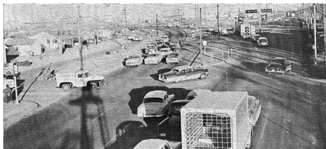
Historic photos of 46th Avenue from Commemorating the Opening of the East 46th Avenue Freeway (I-70), 1964